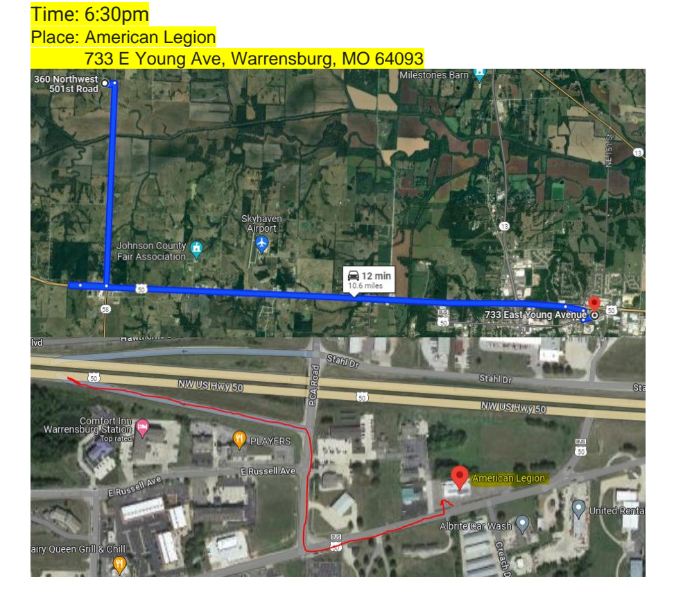
THANK YOU FOR SUPPORTING OUR CLUB!

We will also have a raffle event. Details will be posted at check in. Bring Cash!